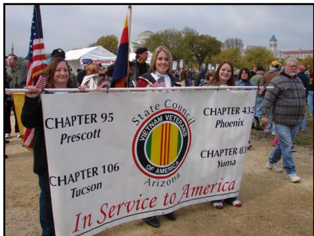
Daughters of Vietnam Veterans of America Arizona State Council march in the 25 th Anniversary Parade.