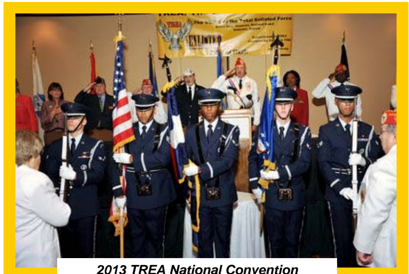
2013 TREA National Convention