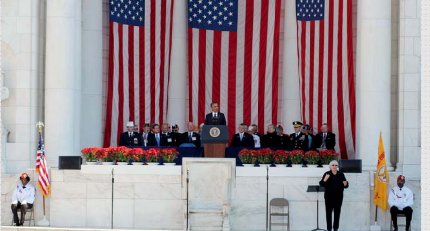
President Obama speaks at 2012 Veterans Day Celebration in Washington, D.C. hosted by The Enlisted Association TREA.