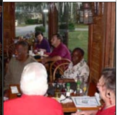
Membership enjoying the Dec 8, 2012 Christmas Luncheon and General Membership Meeting