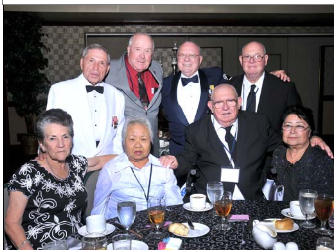
Chapter 58 Delegates and Wives "Installation Dinner"